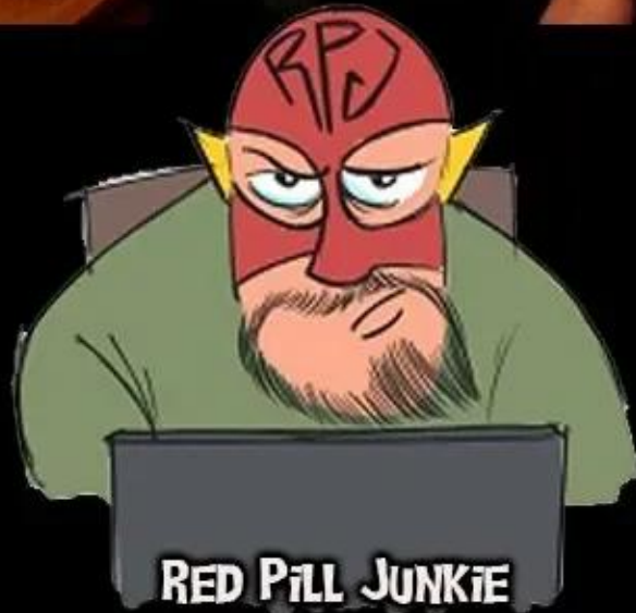
RED PILL JUNKIE